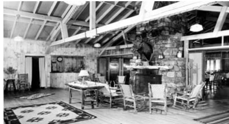
The lounge area in the lodge