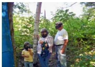
A dedicated volunteer collecting "gander wood" for fund-raising purposes.