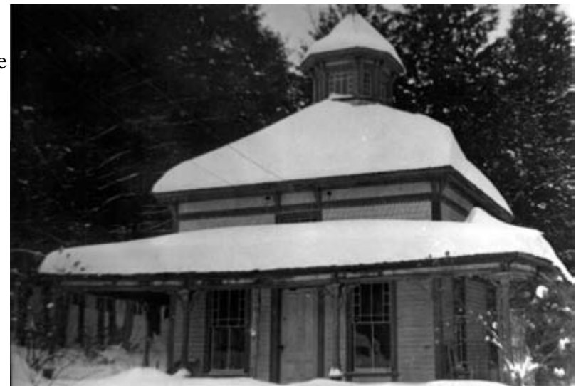
The old Spring House