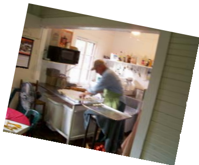
Baking going on in the kitchen

We had a wonderful turnout for our Labor Day Encampment this past Fall. While we had a busy fun-filled time, there was also time for fellowship and spiritual interaction !