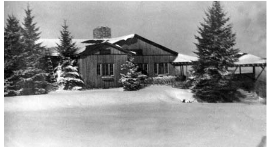
The lodge in winter